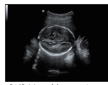
Fetal Brain image of obese pregnant woman

Easier and faster acquisition of images across all body types