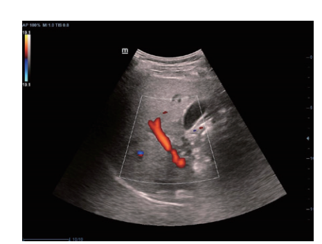
ABD image in B+Color mode

More organ details in 2D image when color mode is on