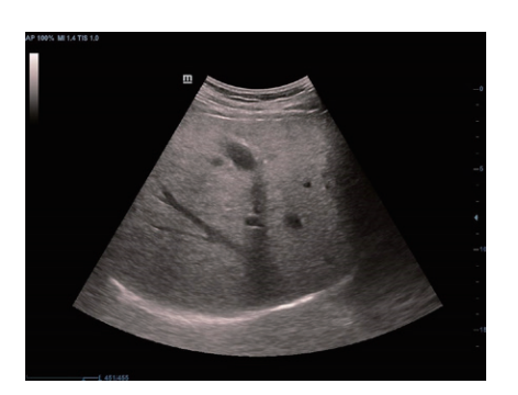
ABD image in B mode

More organ details in 2D image when color mode is on